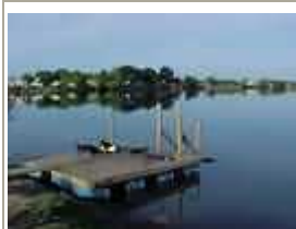
West boat dock